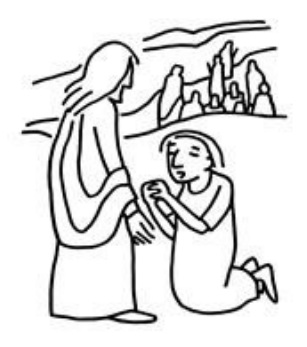
Jesus, have mercy on us.

The gospel of the Lord. Praise to you, O Christ.