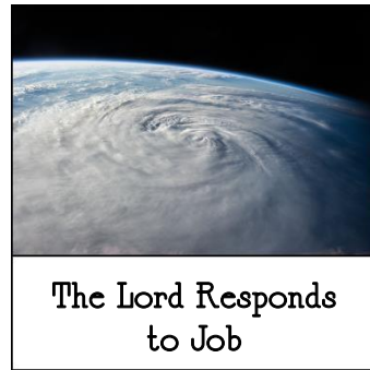
The Lord Responds to Job

Use this resource at home to guide your household's daily devotions.