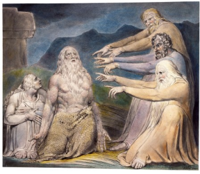
Job Rebuked by His Friends.